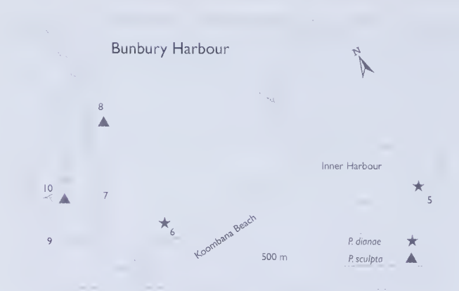
Figure 2. Distribution of sphaeromatid isopods in Bunbury Harbour.

Edwards 1840), Syncassidina aestuaria Baker, 1928, Paracerceis sculpta (Holmes 1904) and Paradella dianae (Menzies 1962). Sphaeroma quoyanum, S. aestuaria and C. gambosa define an estuarine environment. We found their occurrence restricted to the Leschenault Estuary and the Collie River, with C. gambosa occurring exclusively in the Collie River (Fig 1). Collecting in the estuary yielded only a few specimens while particularly S. quoyanum was found in great abundance on bridge piles in the Collie river. Overall, the species diversity and the availability of hard substrates as habitat is higher in the Collie River than the estuary. Bunbury Harbour, on the other hand, offers a great number of colonizable hard substrates mainly in the form of man-made constructions such as jetties and groynes. Two species, P. dianae and P. sculpta, were collected from these habitats (Fig 2). P. sculpta usually resides among algae, barnacles, ascidians and fanworms while P. dianae also colonizes the underside of rocks. Both species are known to be introduced to harbours around the world, but P. sculpta has not been reported before from Western Australia. The occurrence of l. excavatus, Exosphaeroma sp and C. trilobita in 1995 could not be confirmed in 1997 (Table 1).